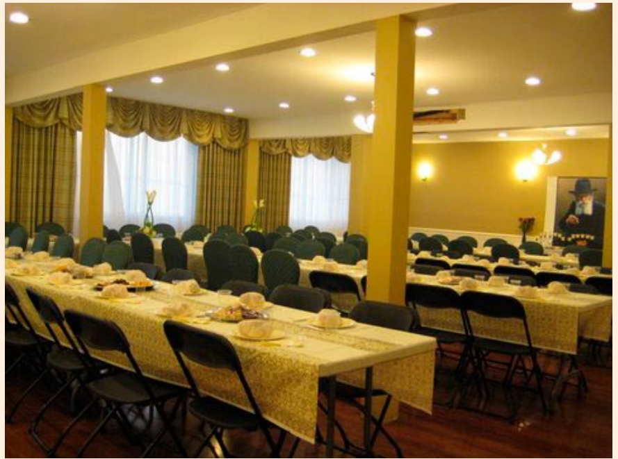
New center in Côte Saint Luc

These astonishing developments prove that even in difficult times, our Community is united in action and profoundly committed to bettering the lives of our fellow Jews. May G-d bless our efforts, now and in the New Year!